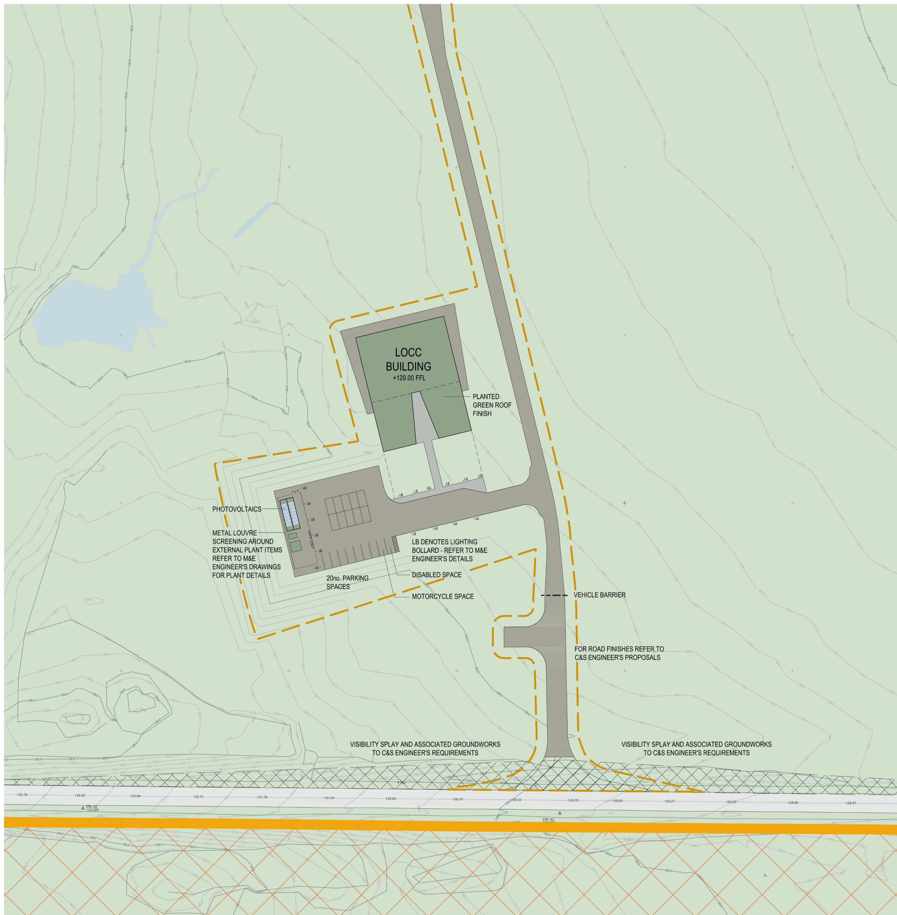
DRAWING EXTRACT - LOCC SITE PLAN AS APPROVED REF: 20/00616/FUL, 5 th AUGUST 2020